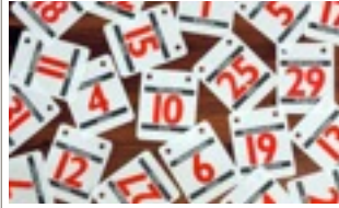
2016 SPECIAL DATES PAGE 09