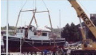
LAUNCH SCHEDULE PAGE 08