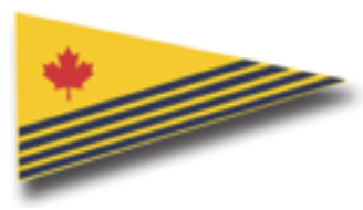
A LIST & B LIST MEMBERSHIP REPORT