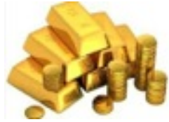
NEW DEADLINES TREASURERS REPORT