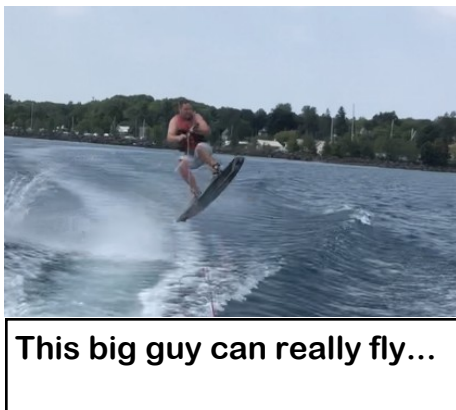
This big guy can really fly...