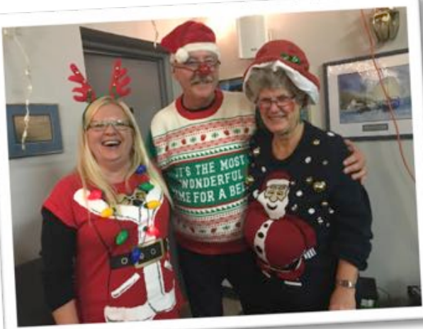
Christmas Potluck and Ugly Sweater Contest