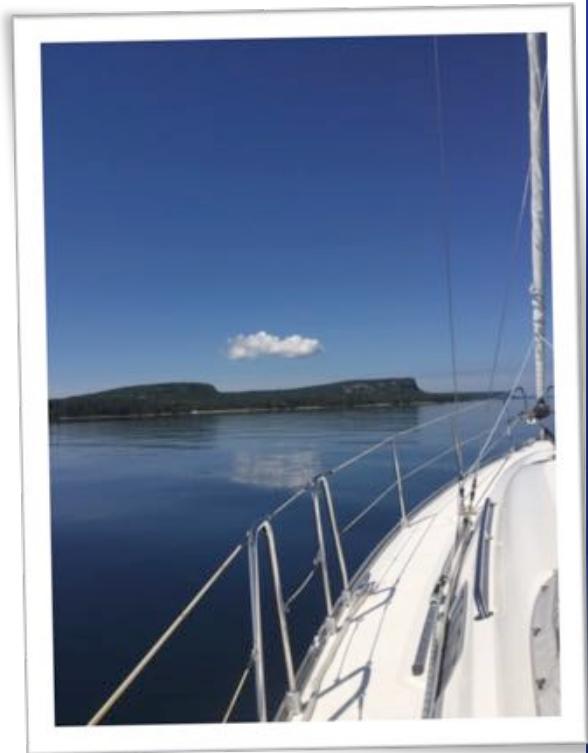
Sole passage on Nyala, on route to North Shore June 29th, approaching the bluffs at Cabot Head.

Phone 519-373-6101 Cell secretary@georgianyachtclub.com