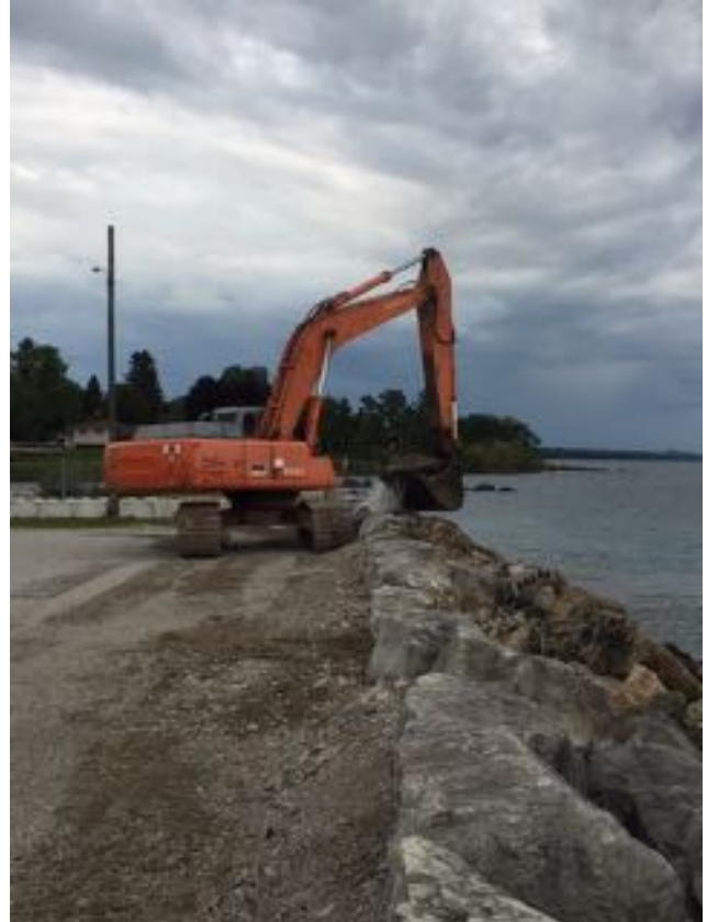
Shoring up the break wall in August