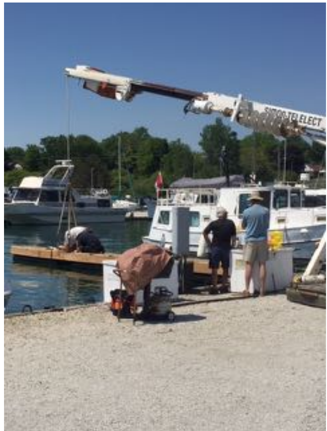
Installing floating docks