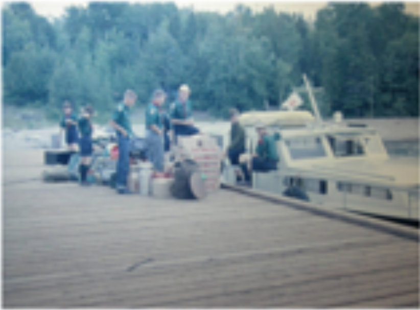
Scouts on White Cloud Island – 1968