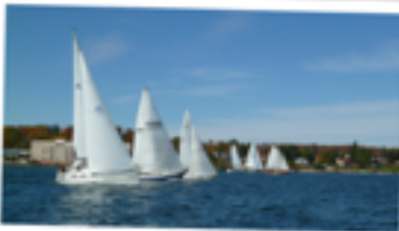
Putnam Race 2010

519-373-6101 secretary@georgianyachtclub.com