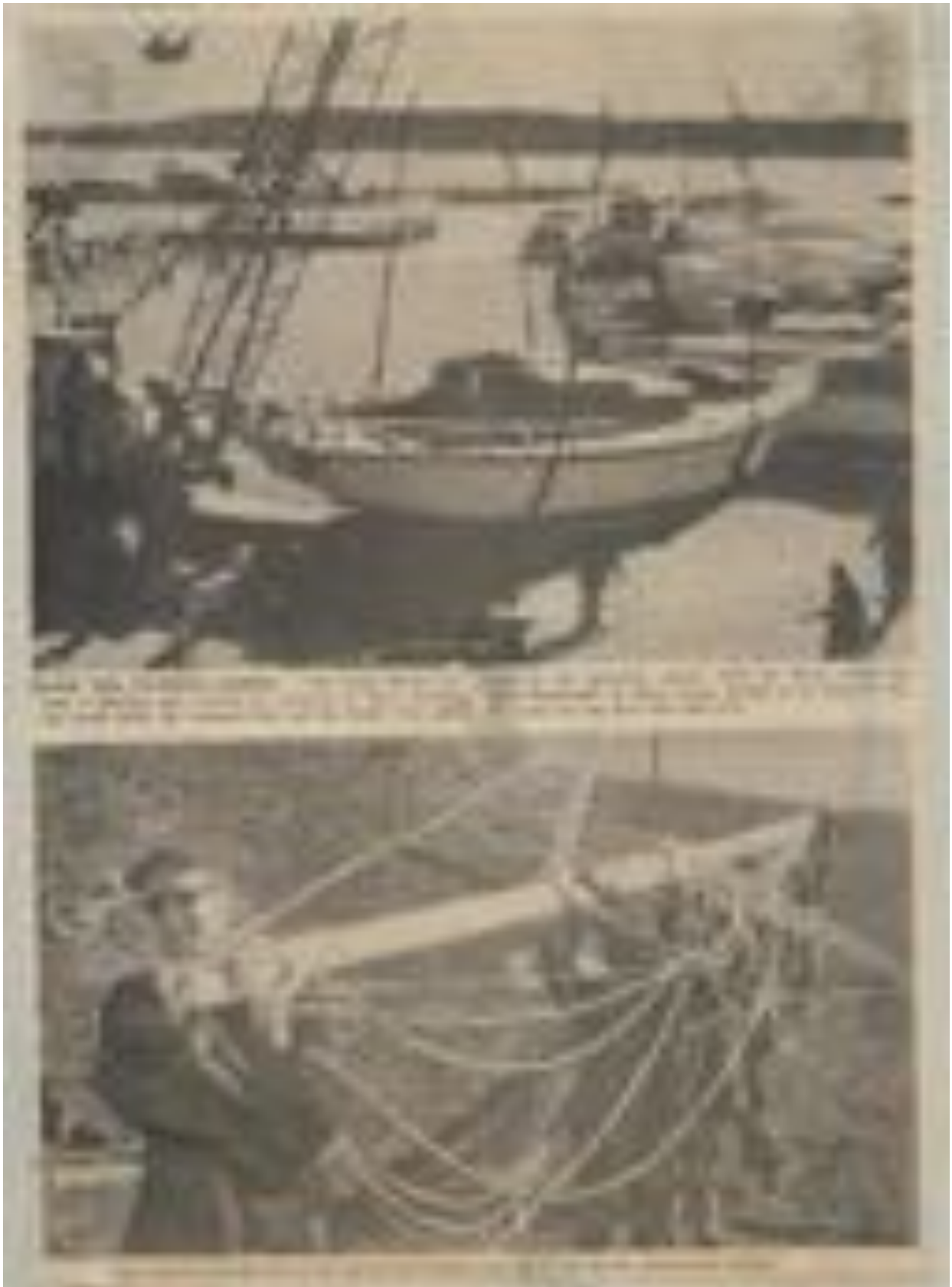
Getting ready for launch: an age-old tradition