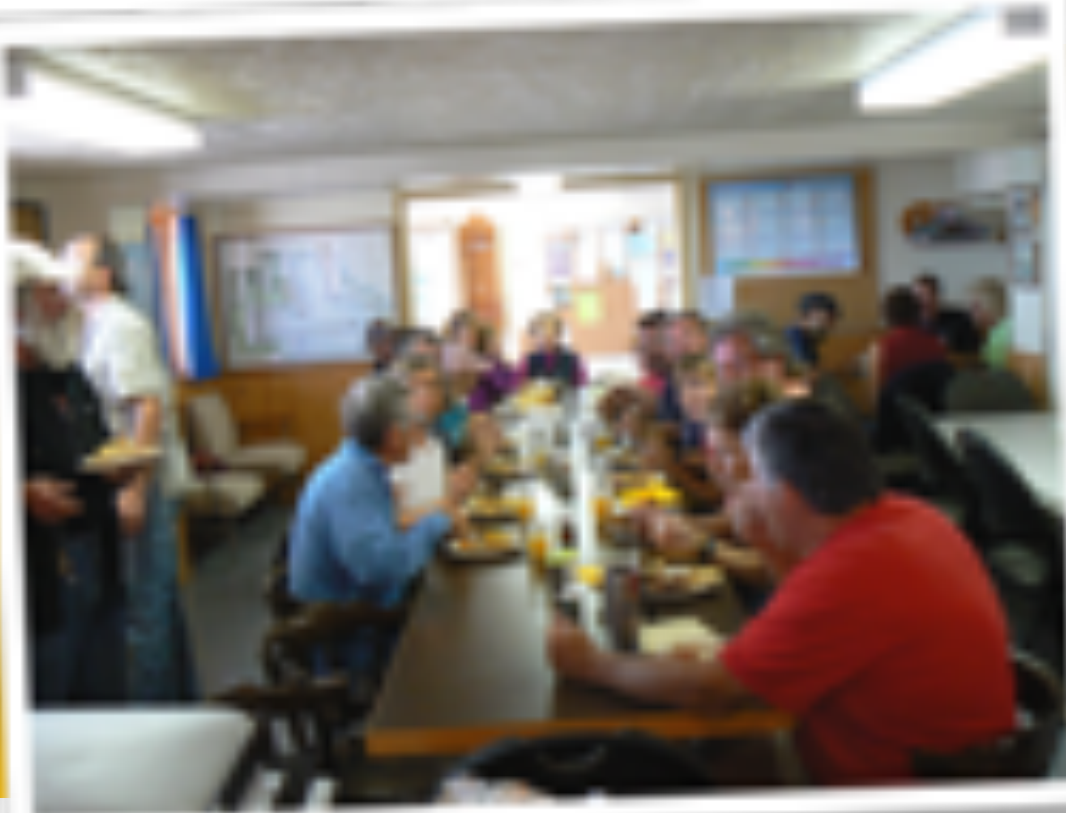
Pre-race breakfast – Putnam Sail Race 2009