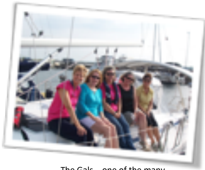
The Gals – one of the many overnights arranged with club members over the years.

The Annual General Meeting on Wed April 14 th was held virtually again this year. We look forward