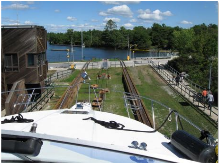
Going up the Big Chute marine railway