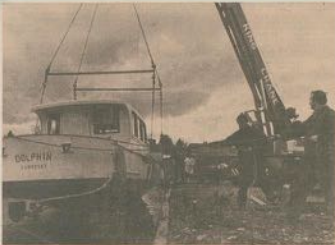
YACHTING SEASON OVER — Members of the Georgetown Yacht Club hoisted out the last of their yachts

Wednesday is officially close the 1973 sailing season. There are still some boats left in the water which will come out by winter sail.