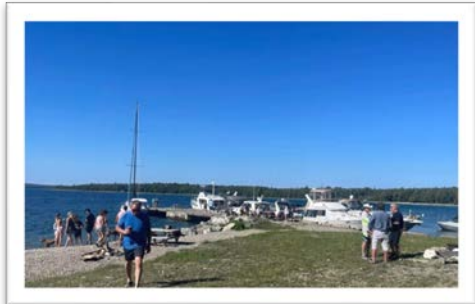
Commodores Cruise 2024

With our support of local programs like The Breakwinders sailing club in Wiarton, (a program teaching young people the art of sailing), continued Sail Racing, and the reinvigoration of the Commodores Cruise we have a jam-packed season ahead for all types of boaters!