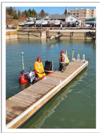
AGUAV surveyors- taking a break during the bathymetric survey