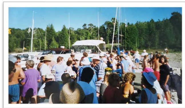
Commodores Cruise circa mid 1990's

We will be combining the Equipment Training Day with the New Member/Associate BBQ this year in an effort to educate as well as socialize with our newest GYC'ers. Date May 31st, more to be announced stay tuned for a free lunch!